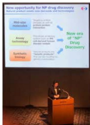
Discussion at the 8 th APAC Annual Meeting