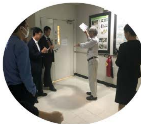
Meeting at BIOTEC