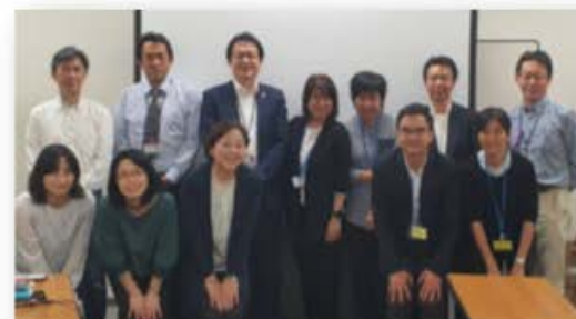
Meeting at EISAI